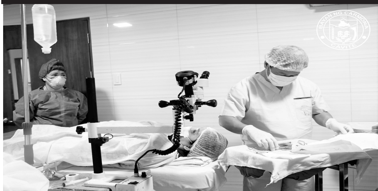
Nagsagawa ang Pamahalaang Bayan sa pamamagitan ng Municipal Health Office ng libreng cataract extraction and pterygium excision sa 20 pasyente kahapon, Pebrero 17. Binigyan din ang mga pasyente ng libreng laboratory examination, Cardio-Pulmonary Clearance, lens, at pre-operation at post-operation medicines. Ang aktibidad na ito ay bahagi ng pagdiriwang ng ika-164 taon ng pagkakatag ng Bayan ng Carmona, Cavite.